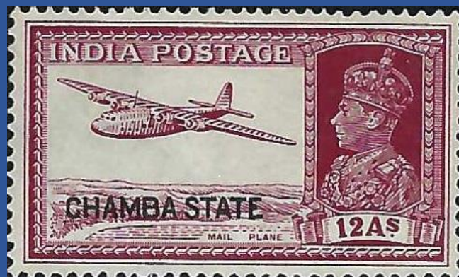
India Chamba Scott 81 12A, carmine lake, 1938