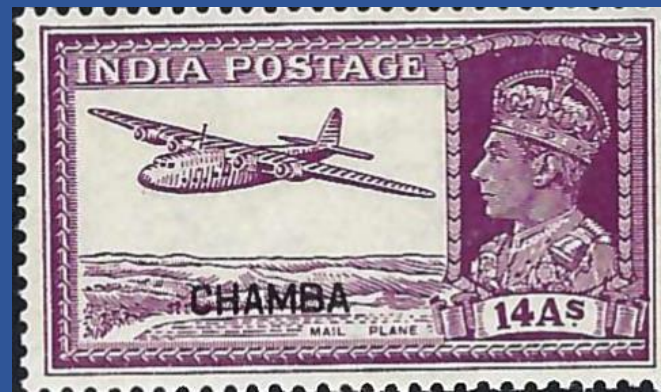
India Chamba Scott 107 14A rose violet 1948