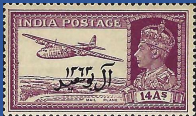
Muscat (& Oman) Scott 13 14A rose violet 1944