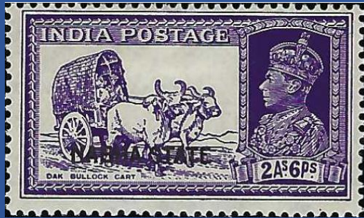
DAK BULLOCK CART