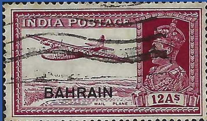
Bahrain Scott 31 12A, claret 1940