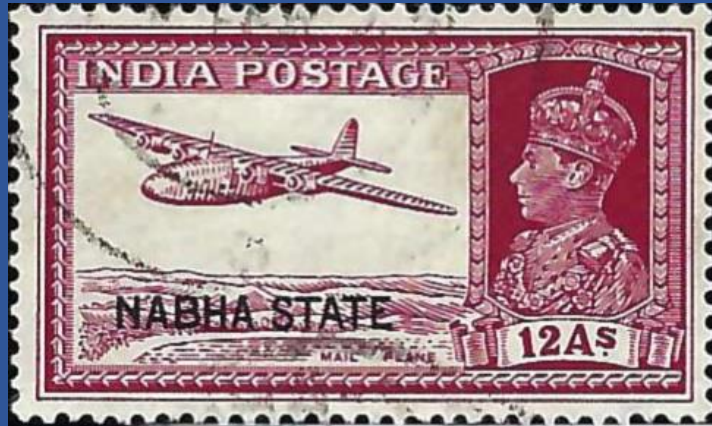
India Nabha Scott 80 12A carmine lake 1938-39