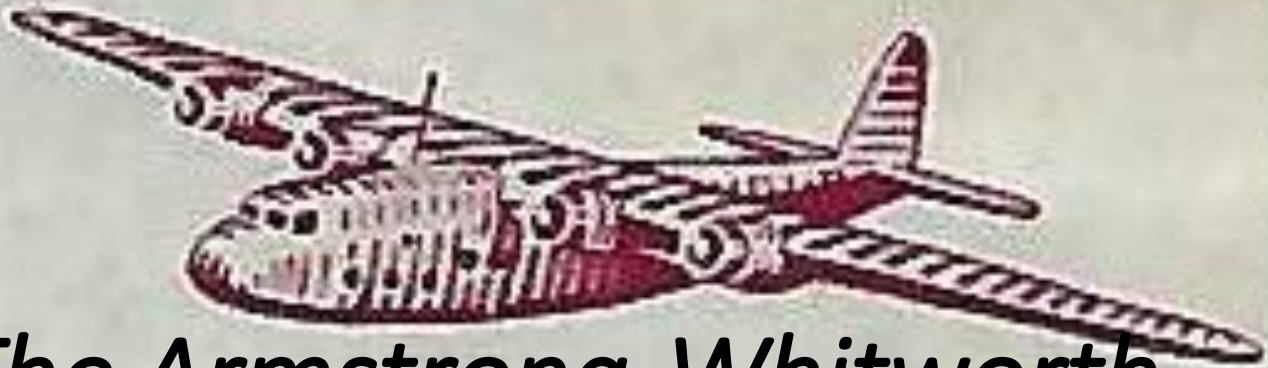
The Armstrong-Whitworth AW-27 Ensign