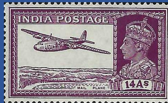
India Scott 161A 14A, rose violet, 1940, (note larger portrait of George VI)