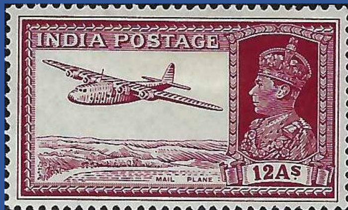
India Scott 161 12A, carmine lake 1937-1940