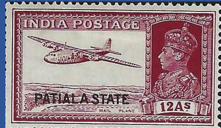
India Patiala Scott 91 12A carmine lake 1938