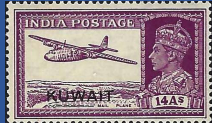
Kuwait Scott 71 14A rose violet 1945