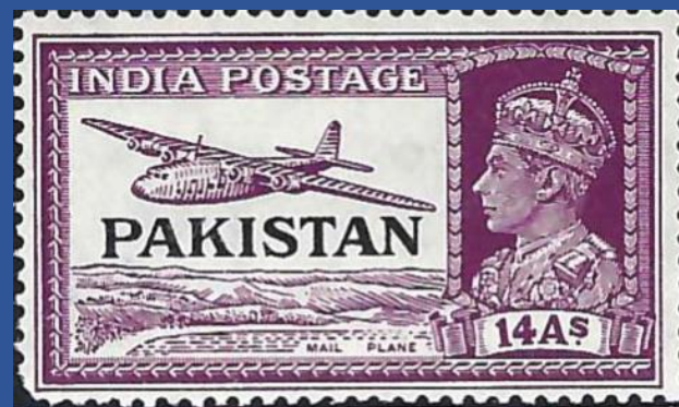
Pakistan Scott 13 14A rose violet 1947