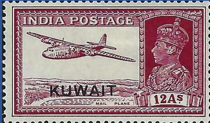
Kuwait Scott 52 12A carmine lake 1939